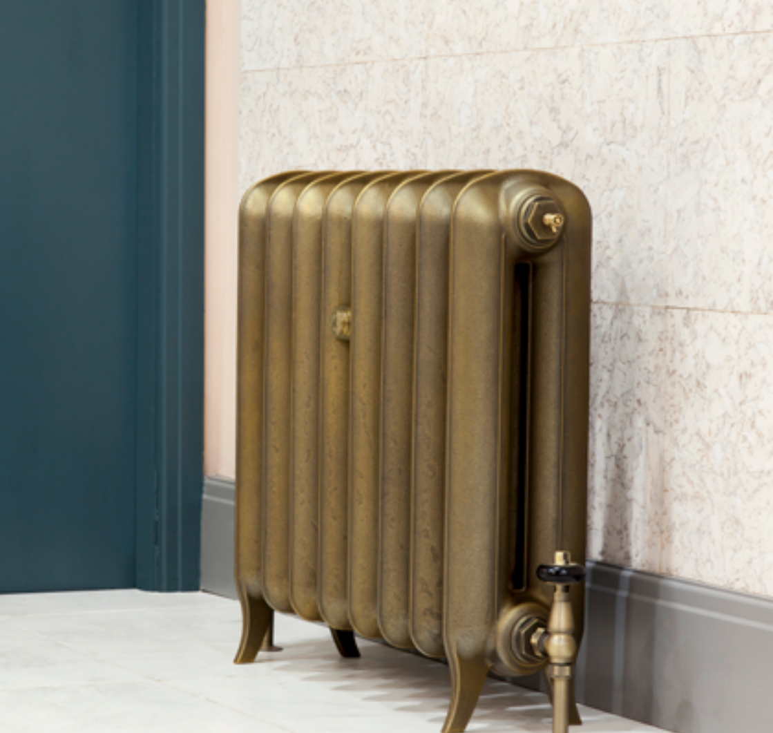
Neptune II 520mm in Beaten Brass with Windsor Natural Brass TRV.

Available in all 52 Castrads exclusive finishes as well as Farrow & Ball® and Little Greene® paints. Lead times from 7-10 working days.