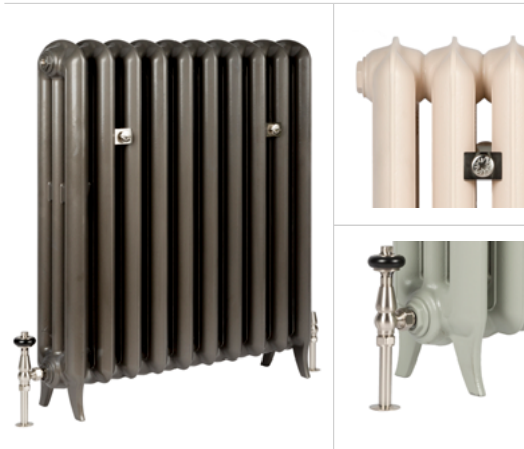
Above left: Neptune III 920mm in Lacquered Iron. Top right: Neptune III in Farrow & Ball® Setting Plaster. Bottom right: Neptune III in Farrow & Ball® Pigeon.